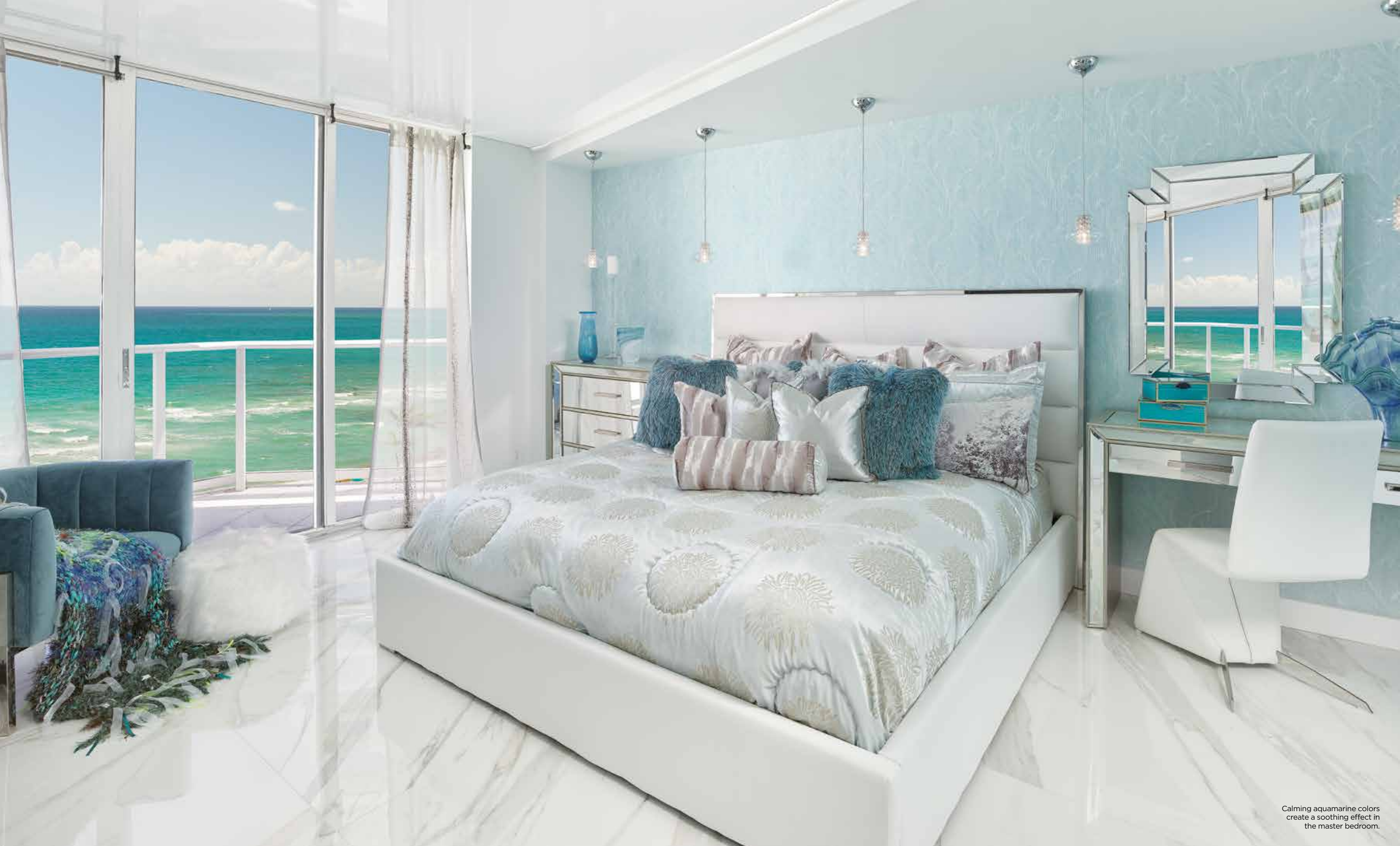
Calming aquamarine colors create a soothing effect in the master bedroom.